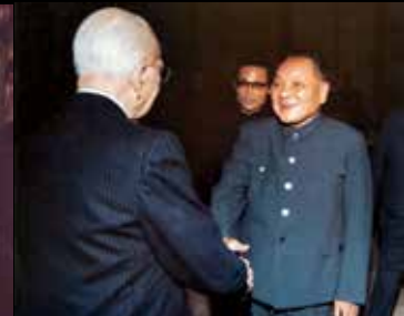
With Chinese Premier Deng Xiaoping in Beijing.

HERBERT W. ARMSTRONG WAS recognized and respected by leaders in government, industry and education around the world. Until his death in 1986, he was pastor general of the Worldwide Church of God (WCG) and editor in chief of the Plain Truth magazine, which he began publishing in 1934. In 1947, Mr. Armstrong founded Ambassador College in Pasadena, California, and later established campuses in Texas and the U.K. He was also founder and chairman of the Ambassador International Cultural Foundation, known for its cultural and humanitarian activities.