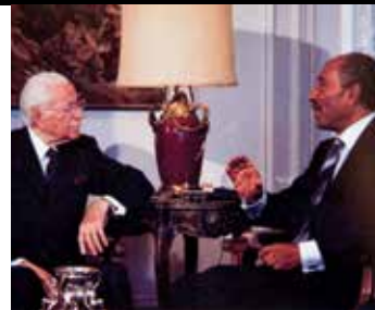
With Egyptian President Anwar el-Sadat in Cairo